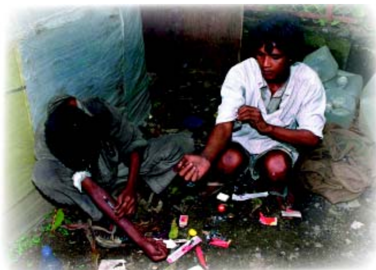
Injecting drug users put themselves at risk, especially when sharing needles.

As efforts to reduce smoking and tobacco use in Europe and North America show some success, tobacco companies increasingly aim to recruit new smokers from developing countries. As a result, worldwide mortality from smoking related diseases is expected to rise to 10 million deaths a year by 2030, more than the total of deaths from malaria, maternal and major childhood conditions and tuberculosis combined. Over 70% of these deaths will be in the developing world.