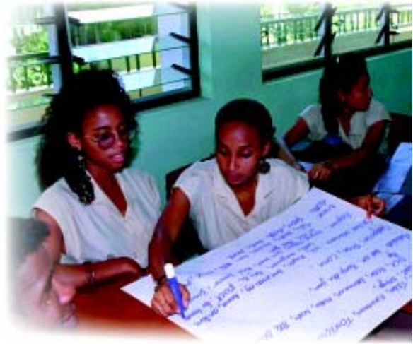
Students take part in a sex education lesson in the Seychelles.

Schools provide a natural entry point for reaching young people with health education and services. In the five years to 1996, it was estimated that the number of children enrolled in primary education increased by approximately 50 million, and the increase was most rapid amongst girls. Secondary school enrolment is also increasing.