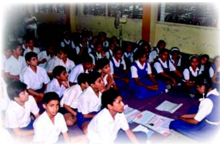
Peer education in India.

duplication and confusion. Agencies should know what others can offer and how to access mainstream services. Developing consistency and co-ordination between services at specialist centres and in neighbourhood health centres is important, so that care is followed up and harm reduction messages are reinforced.