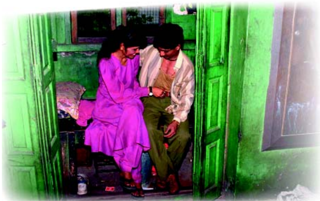
Unprotected sex puts adolescents at risk of pregnancy and sexually transmitted infections.

young girl, without necessarily putting her at lesser physical risk. Young adolescent married girls have little control over contraception and are expected to take part in unprotected sex at an age when this would meet with strong social disapproval outside marriage. In fact young and vulnerable married girls may be isolated from even the minimal health services offered to unmarried adolescents.