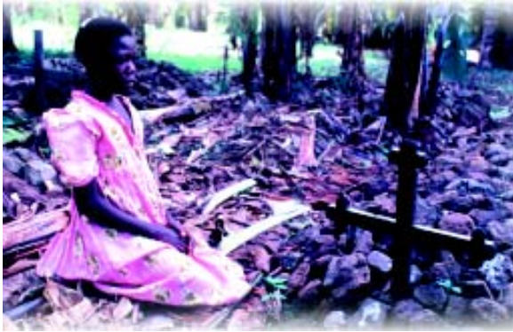
AIDS leaves many young people as orphans at a time when they most need parental support.

or by workers employed by international agencies. Children in all institutions are at risk, including adolescents in prison, and adolescents with disabilities in institutional care.