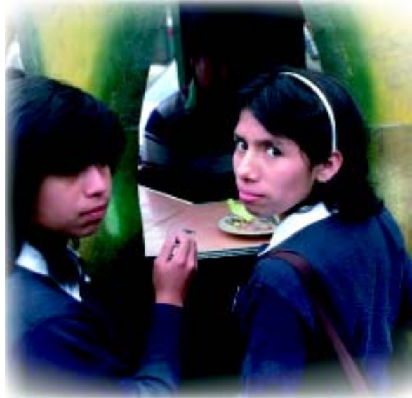
Young people need a safe and supportive environment, information and skills, and health services and counselling.