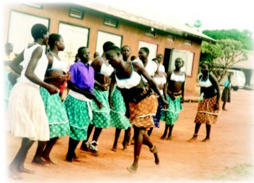
Girls who had been abducted by a rebel army in Northern Uganda celebrate their freedom at a rehabilitation centre in Northern Uganda. Adolescents caught up by violence are often sexually abused.

between young males with an audience, often leave participants with no easy way out. Young males are often afraid in such situations, but lack skills at defusing tension and get into fights that they did not want to have. One-to-one fights with bare hands do not usually result in serious injury. However, young men in gangs are more likely to use weapons, transforming a pride bruising fist fight, into a potentially fatal encounter with a knife or gun.