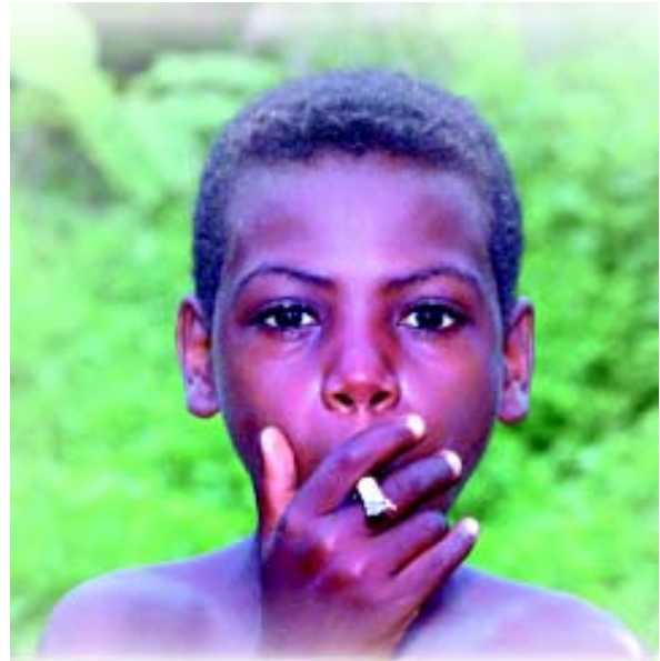
Young adolescents are attracted to smoking without understanding the impact it will have on their lives.

The most effective measures prevent adolescents from taking up smoking in the first place. They include bans on tobacco advertising, increasing the price of tobacco products through taxation and creating smoke-free areas at schools, colleges, health facilities and sporting venues. Tobacco taxes have their greatest impact on young smokers.