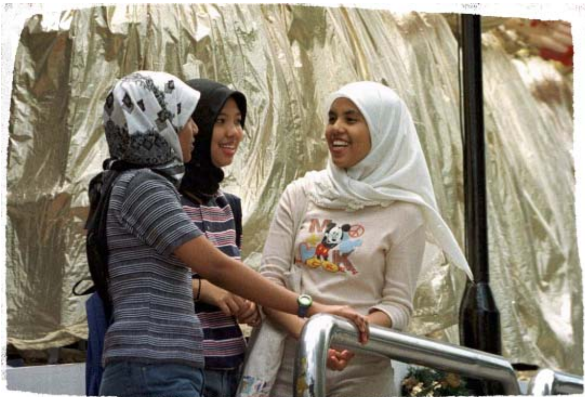
Adolescent girls in Malaysia. Photo: Associated Press