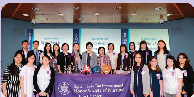
Congratulations to the new inductees.