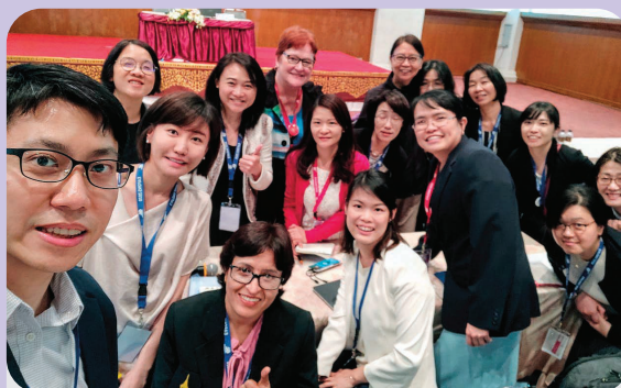
Asia Region Meeting 2020 at EAFONS on 10 January 2020