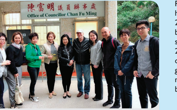
Mental health seminar, blood test, and health education for older people on 17 March 2018.

Pi lota Chapter has endeavored to promote healthy living in the community. On 10th March 2018, we conducted a talk about how exercise can benefit health, followed by a workshop teaching simple exercise to promote health. On 17th March 2018, we conducted a talk about mental health for older people, followed by an onsite blood test for glucose and cholesterol. After the blood test, our nurse experts provided an interpretation of the blood test results and related health education.