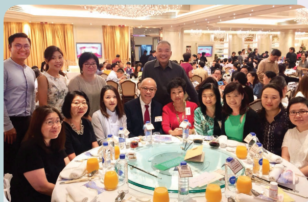
A group photo taken at the celebration dinner