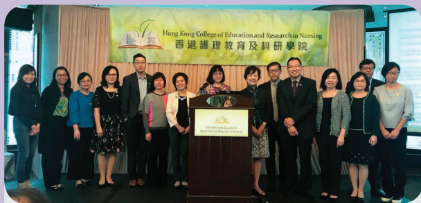
A photo taken at the Annual General Meeting of the HKCERN

PIC members who are also fellows of the Hong Kong College of Education and Research (HKCERN) joined the 5th Annual General Meeting of the HKCERN on 18 November 2017. A scientific forum was held on the same day and many of our members participated in this scholarly activity to exchange their ideas about the 'Challenges and Future Direction of Nursing Education'.