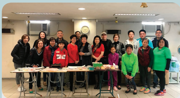
PIC Programme Committee Members and workshop volunteers.